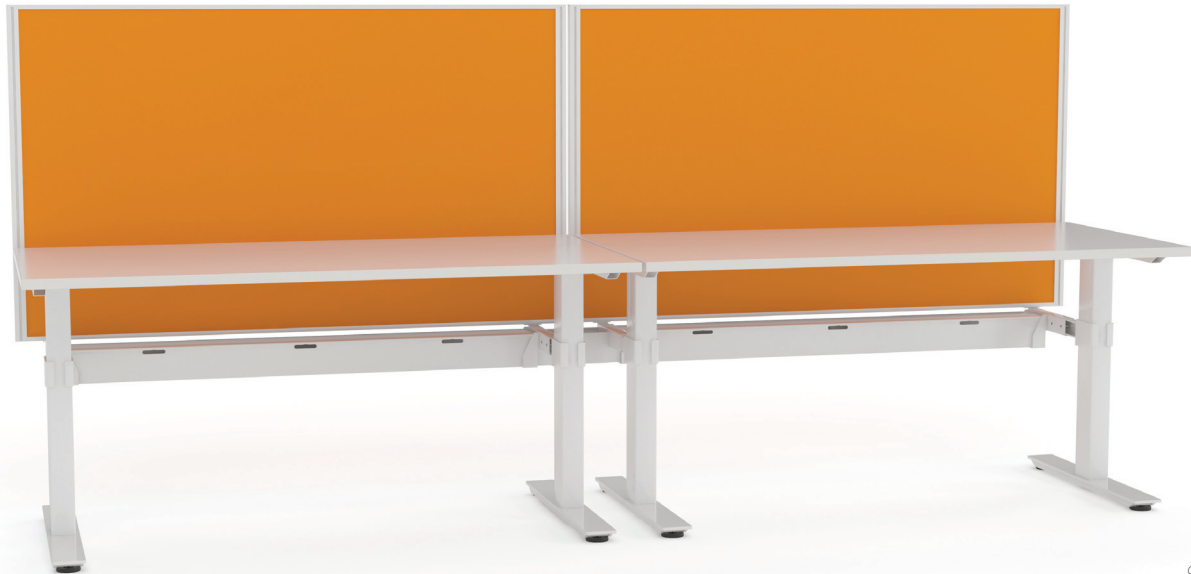
Anvil Fixed Height desking straightline