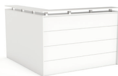
Axis Corner Reception with Pop-top