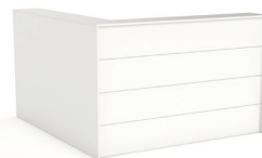
Axis Corner Reception without Pop-top