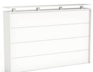
Axis Straight Reception with Pop-top