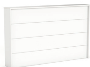
Axis Straight Reception without Pop-top