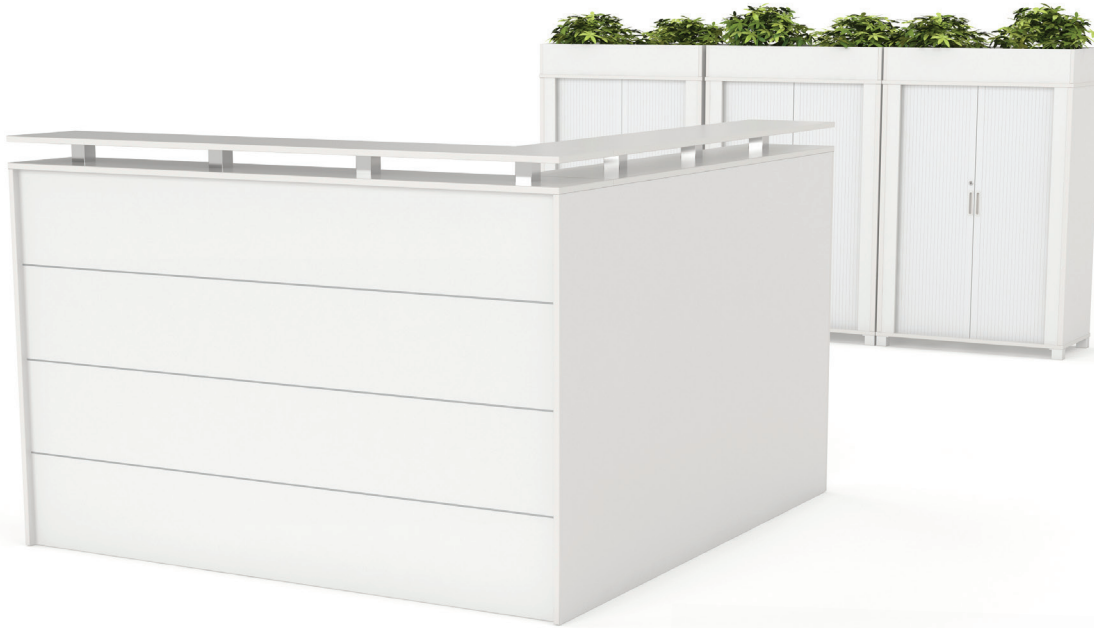
Showing Axis 90° Reception and 1250mm Tambour Storage with planter box