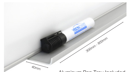
Aluminum Pen Tray Included