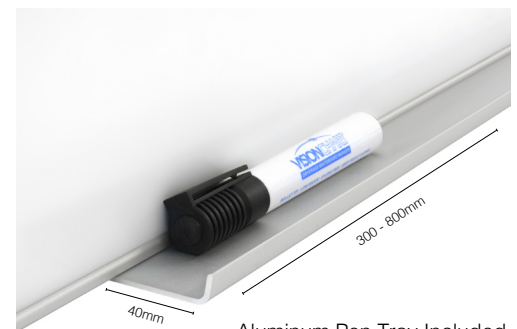
Aluminum Pen Tray Included